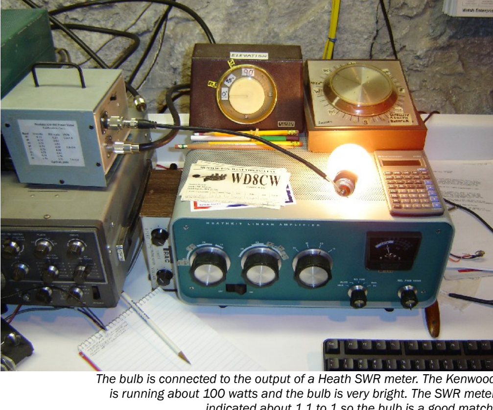
The bulb is connected to the output of a Heath SWR meter. The Kenwood is running about 100 watts and the bulb is very bright. The SWR meter indicated about 1.1 to 1 so the bulb is a good match.

The next day was sunny but cold so I went outside and let the 75 meter antenna down. After looking everything over I disconnected the coax feedline from the antenna balun and used a coaxial coupler (barrel) to attach the bulb to the feedline. Back inside the shack I