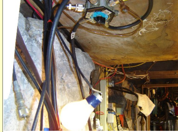
Here the bulb is connected to the output of the antenna switch at the 40 meter position. Since the bulb is lightweight, there isn't any problem supporting it while testing. Try that with a Heath Cantenna!

I raised the antenna and retested the SWR and it was good at 1.6 to 1. It seems that whatever corrosion had entered the PL-259 at the antenna balun hadn't had the chance to travel down the coax toward the shack. That was fortunate since big coax is getting really expensive.