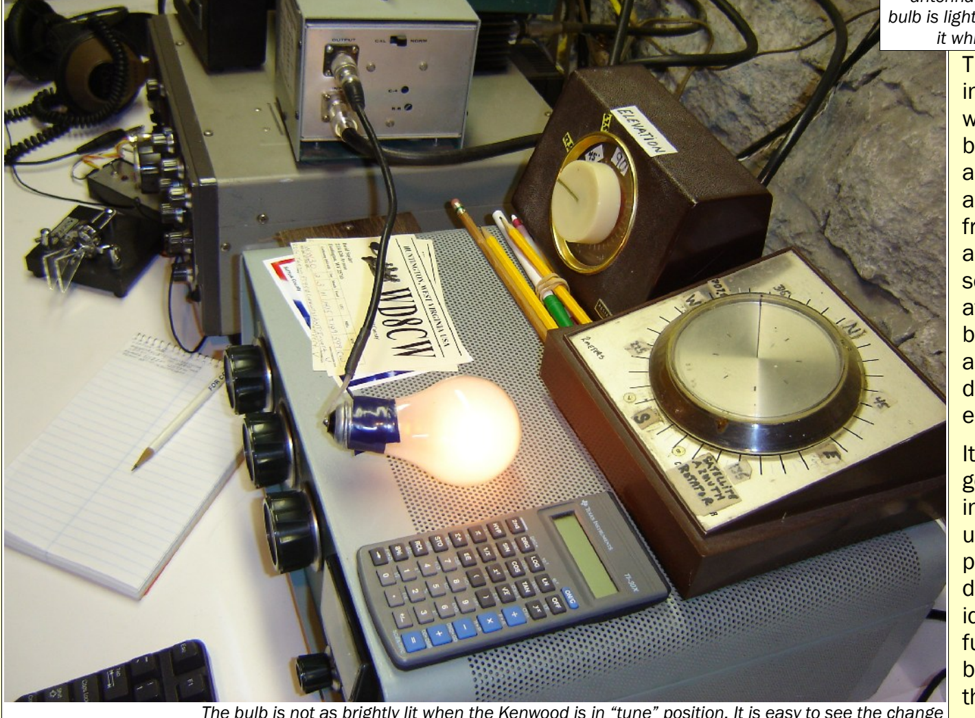
The bulb is not as brightly lit when the Kenwood is in "tune" position. It is easy to see the change in illumination which is a good indicator of RF power.

It might be a good idea to lay in a supply for the future.