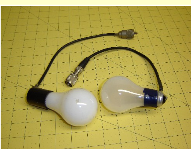
These are two light bulb dummy loads. The left one has a screw-in socket for the bulb. The right one has the coax soldered directly to the bulb center button and the threaded base. While I haven't broken the bulb yet. I put a socket and cable together the make it easier to change bulbs if I did.

After the net I checked the other antennas and found that they also were showing a higher than normal SWR. It had been